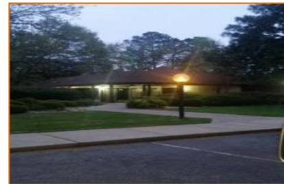
Hidden Lake Clubhouse