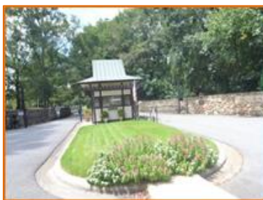
The Guard House

On an annual cost per square foot, dues for our spacious homes compare favorably with other upscale condominium communities.