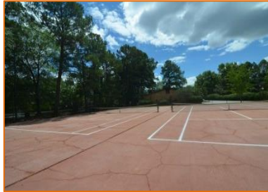
The Tennis Courts